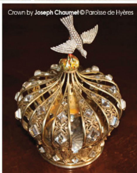
Crown by Joseph Chaumet © Paroisse de Hyères