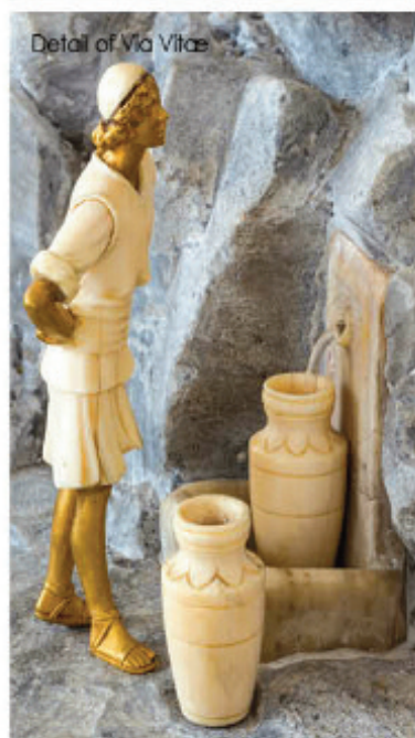
Detail of Via Vitae