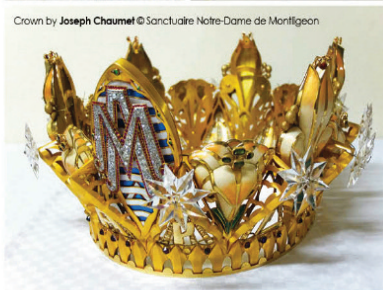
Crown by Joseph Chaumet © Sanctuaire Notre-Dame de Montligeon