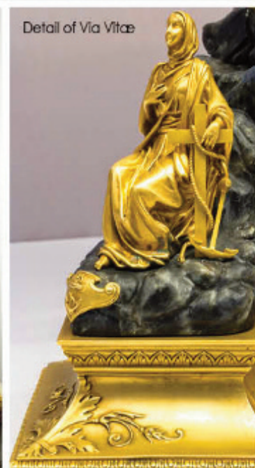
Detail of Via Vitae