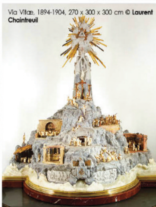
Via Vitae, 1894-1904, 270 x 300 x 300 cm